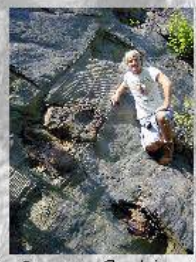
Me at site 2 next to Cordaites tree trunk